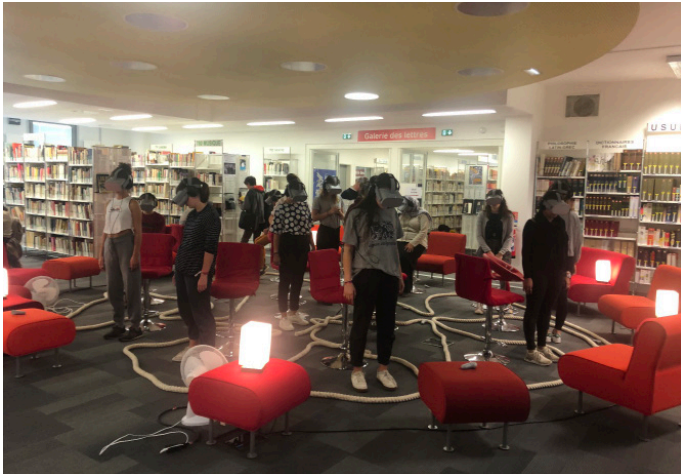
Library | University of Toulouse II Jean Jaurès