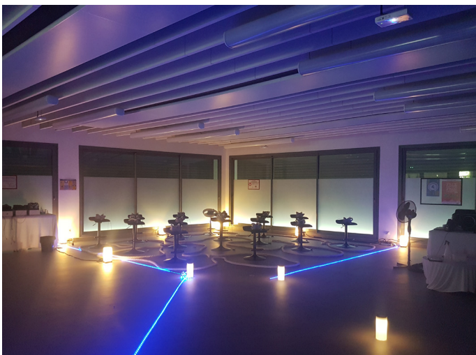
Library Collège Ludovic Bréa | Saint Martin Du Var