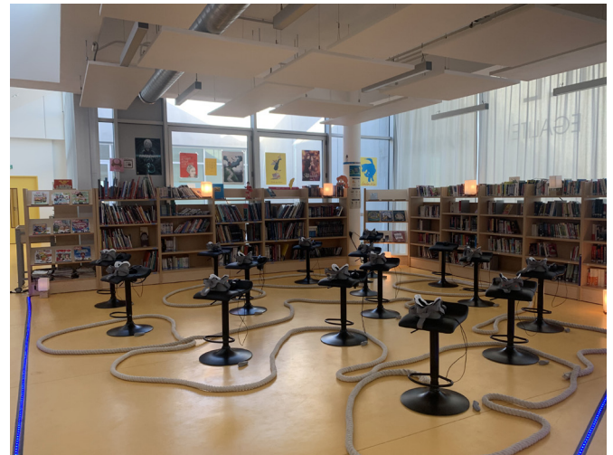
Library | Collège Louise Michel | Clichy-sous-bois