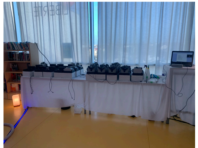
Library Collège Louise Michel | Clichy-sous-bois