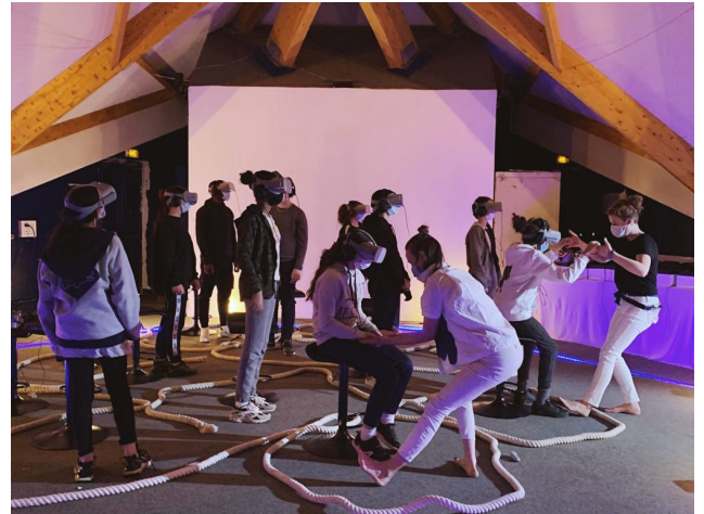
Multipurpose room | Clichy-sous-bois