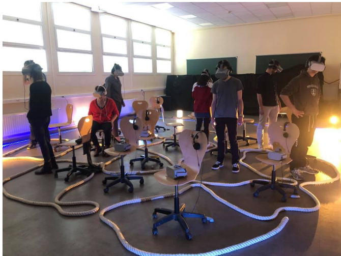
Class room | Alès